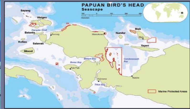
BIRD HEAD BISMARCK