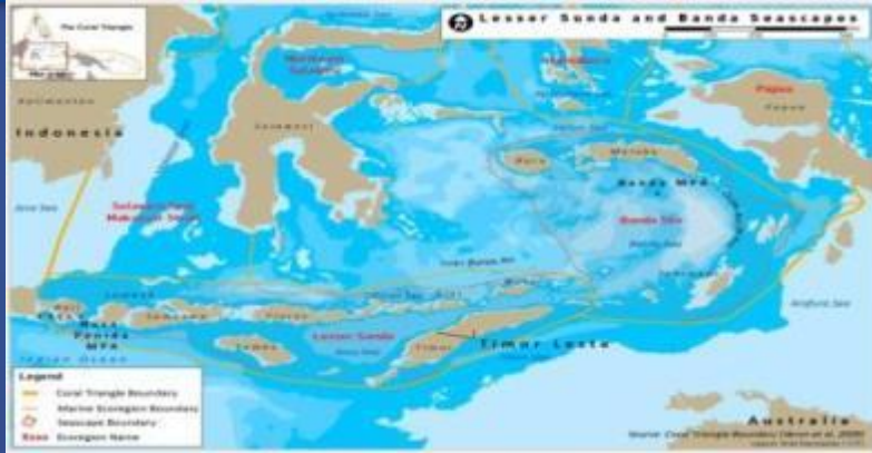
LESSER SUNDA AND BANDA SEASCAPE