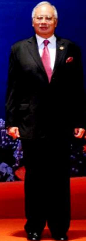
Leaders from the Coral Triangle Countries at CTI Summit, from left: The Prime Minister of Solomon Islands, H.E. Derek Sikua, The President of the Democratic Republic of Timor Leste, H.E. Ramos Horta, The President of The Republic of Indonesia, H.E. Susilo Bambang Yudhoyono, The President of the Republic of the Philippines, H.E. Gloria Macapagal Arroyo, The Prime Minister of Papua New Guinea, H.E. M. Somare and the Prime Minister of Malaysia, H.E. Najib Razak.