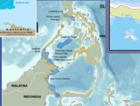
SULU SULAWESI SEASCAPE

Objective #1: Priority seascape programs identified, with investment plans developed and sequenced